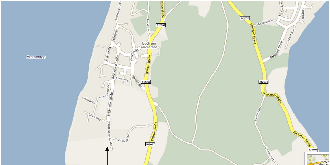
Management Centre Deutsche Post DHL, Breitbrunner Str. 26