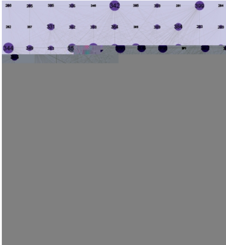
Figure 1: The agglomeration pattern of MNC subsidiaries

(Notes: Each node represents an SIC 3-digit manufacturing industry. Industries in which there is significant agglomeration at 200 km are linked. The size of each node is proportional to the number of agglomerating industries.)